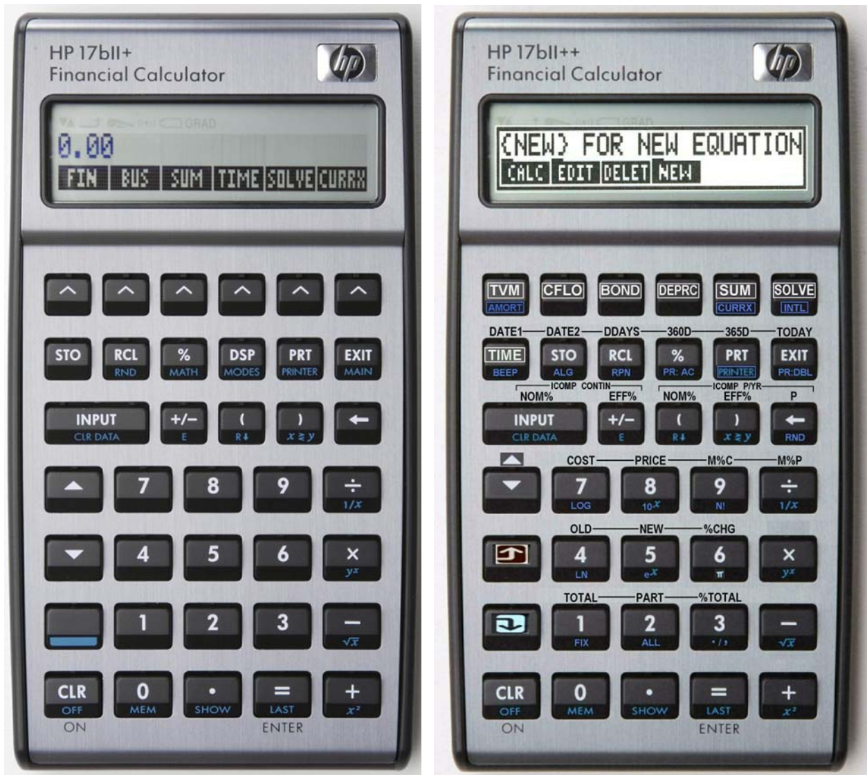
Figure 3. The current HP17BII+ and the newly-proposed “HP17BII++” containing display, menu and keyboard updates to improve ease of use by both reducing keystrokes and providing additional information on the keyboard and in the LCD. Key labels with frames drawn around them represent functions which activate menus in order to distinguish them from labels which simply execute individual functions.