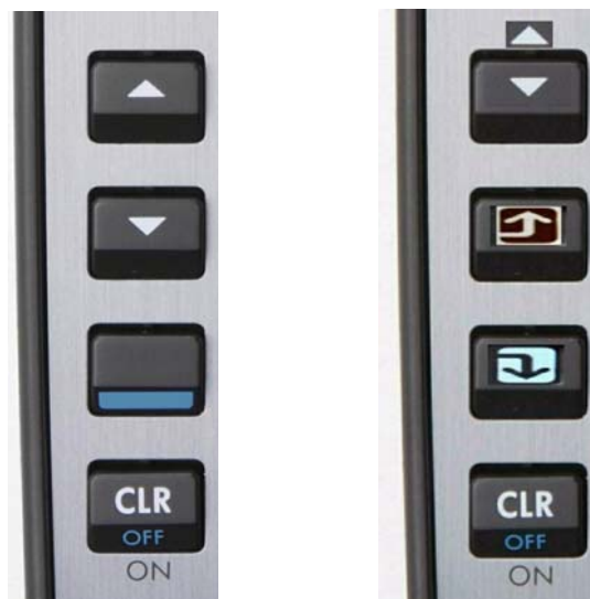
Figure 1. HP17BII+ navigation and shift keys (left) and a proposed version with a second shift key along with navigation keys combined onto one key (right).

respectively. (The HP10B did not have “up” and “down” navigation capability.) Of the remaining three machines, the HP20S, 21S and 32SII placed their “up” and “down” functions on separate shifted key positions elsewhere on the keyboard. Since there is no need for a radical adjustment of functions already on the 17BII+ keyboard, let us add the second shift key just above the first (in the current position of the “down” key) and change the “up” key to a primary “down” key with “up” as the upper-shifted function. Since the function names corresponding to the original shift are on the key fronts below the primary functions, it would be logical to place the “second-shifted” names above the keys. As a result, the shift markings should probably be updated to indicate which is for those functions above and which for those below, in a similar fashion to the Pioneer calcs. This transformation is shown in Figure 1.